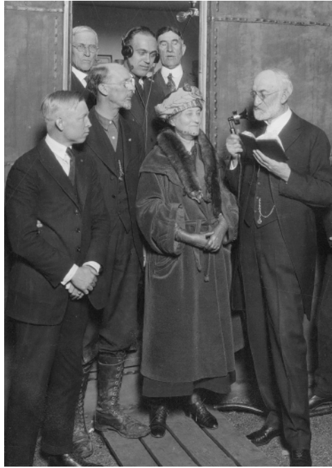
FIG. 7. President Heber J. Grant and others at the inauguration of radio station KZN, May 6, 1922 (detail). When general conference was broadcast over the radio for the first time in October 1924, an estimated one million people were able to hear conference. The radio was the first of many technological advances that have allowed Saints around the world to listen to general conference.

There were probably at least two reasons why President Grant opted to provide separate self-contained sessions of conference, even as amplification and radio capacity made it possible for all to follow along with Tabernacle proceedings. First, it appears that President Grant and other leaders favored direct speaker contact whenever possible. In reporting on general