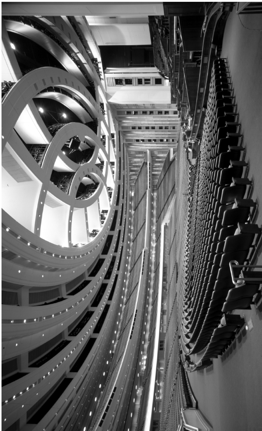
Fig. 8. Interior of Conference Center, 2000. With a seating capacity of over twenty thousand, the Conference Center can accommodate twice as many Saints as the Tabernacle. The various levels of seating

can be easily seen in this view. On the right side is the stand for the General Authorities and the Mormon Tabernacle Choir.