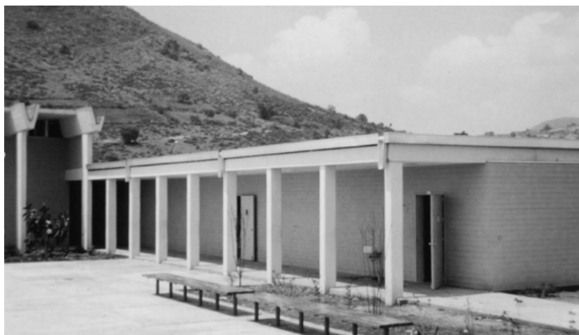
First buildings at Benemérito, c. 1964.

Even though the enrollment at Benemérito stayed consistent for the next decade, changes were afoot that would eventually transform the school into a unique preparatory school. In 1971, the Church adopted a policy to “not duplicate otherwise available” educational opportunities. 92 By the 1980s, the Mexican government was providing more educational opportunities for most elementary and secondary students. Therefore, in 1984, all Church primary and secondary schools were phased out, including those at Benemérito. As a result of closing the primary schools, the normal school at Benemérito was also discontinued. Since 1985, Benemérito de las Américas has functioned solely as a preparatory (high) school. Over the next quarter of a century, enrollment gradually increased in the preparatoria school to over two thousand a year.