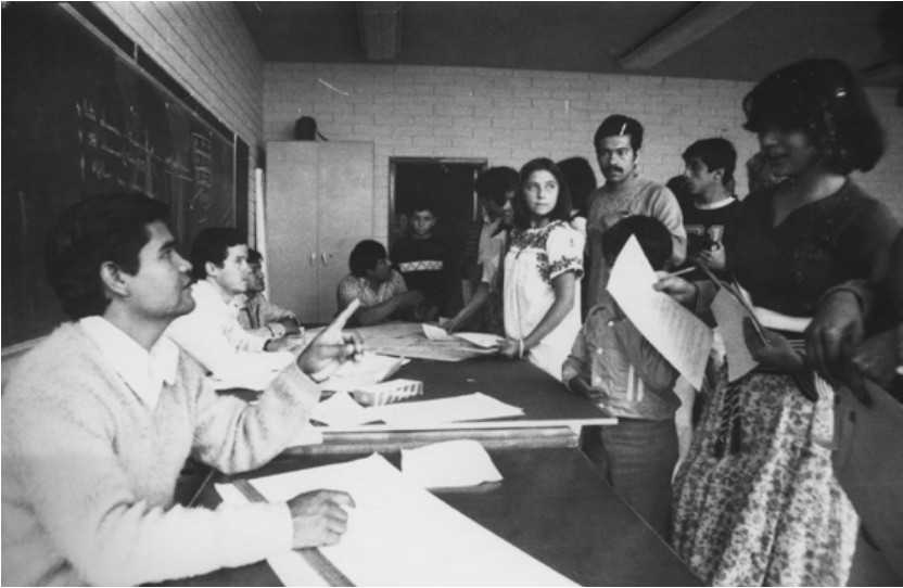
Students register for classes, c. 1967.