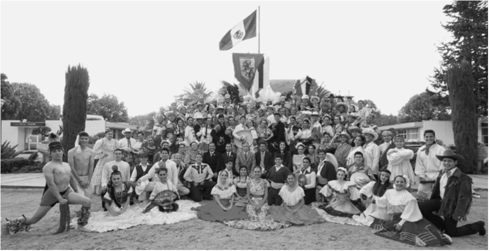
Cultural celebration at the final graduation at Benemérito, recognizing the school's long history as a cultural center for Mexican Latter-day Saints.

United States, Mexico, and throughout Latin America who are preparing to teach in Spanish. 93