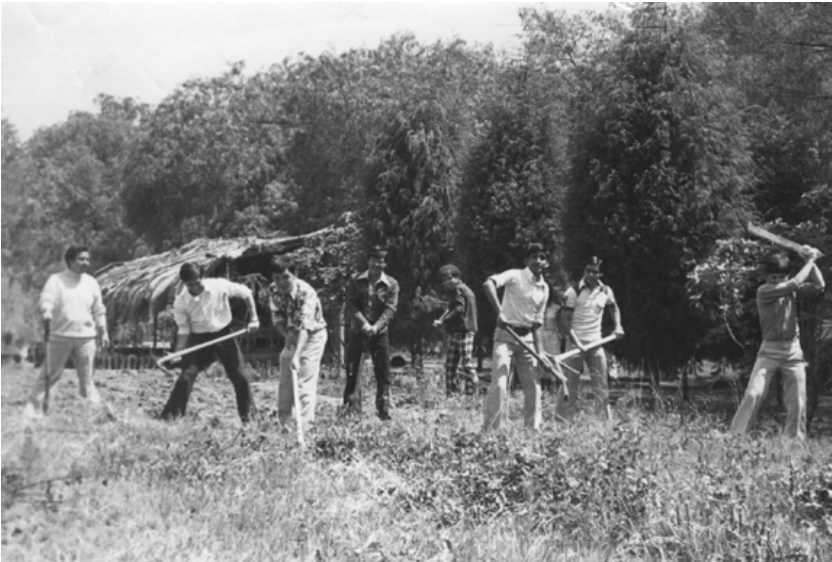
Students and employees at work on the grounds of Benemérito, c. 1967.