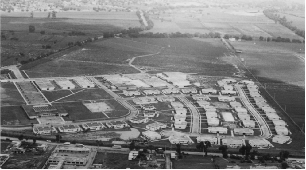
Benemérito school complex seen from the air, showing fifty student houses completed during the year 1967–1968.