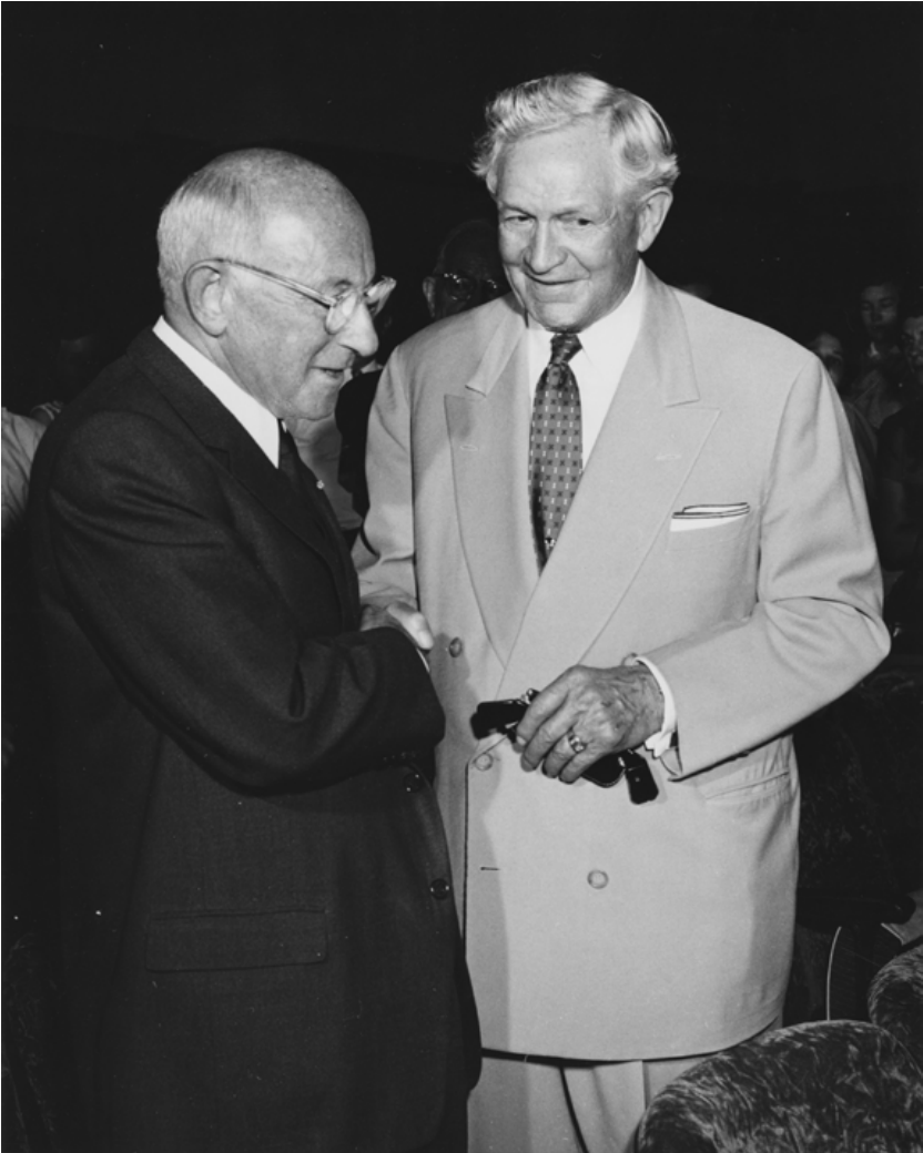
Cecil B. DeMille and David O. McKay, probably in Salt Lake City, circa 1956.