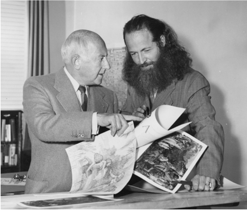
Cecil B. DeMille and Arnold Friberg viewing prints of Friberg's art, circa 1954.

artist Arnold Friberg, set painter for DeMille's epic film The Ten Commandments . Although DeMille had formed good relationships with other religious leaders, 2 which was simply good business, his friendship with President McKay reveals a deeper and long-lasting bond. Through analysis of their private correspondence and public statements, instances of contact and sentiments shared by President McKay and DeMille emerge. This essay also traces how McKay's friendship influenced DeMille to share a more positive image of the Latter-day Saints, which seems to have influenced American perception of the Church of Jesus Christ in the mid-twentieth century.