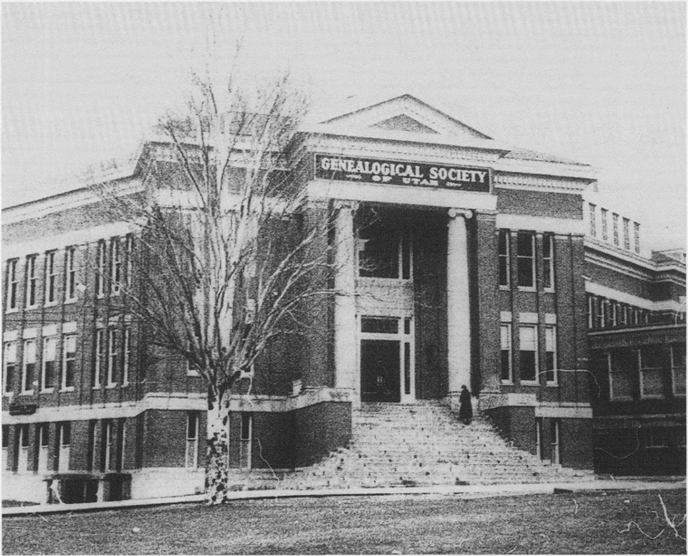
Joseph F. Smith Memorial Building, December 1933, at 80 North Main, Salt Lake City, location of the Genealogical Society, 1934–62.

volumes as well as an elaborate index, and the Society had a large staff of men and women serving the public.