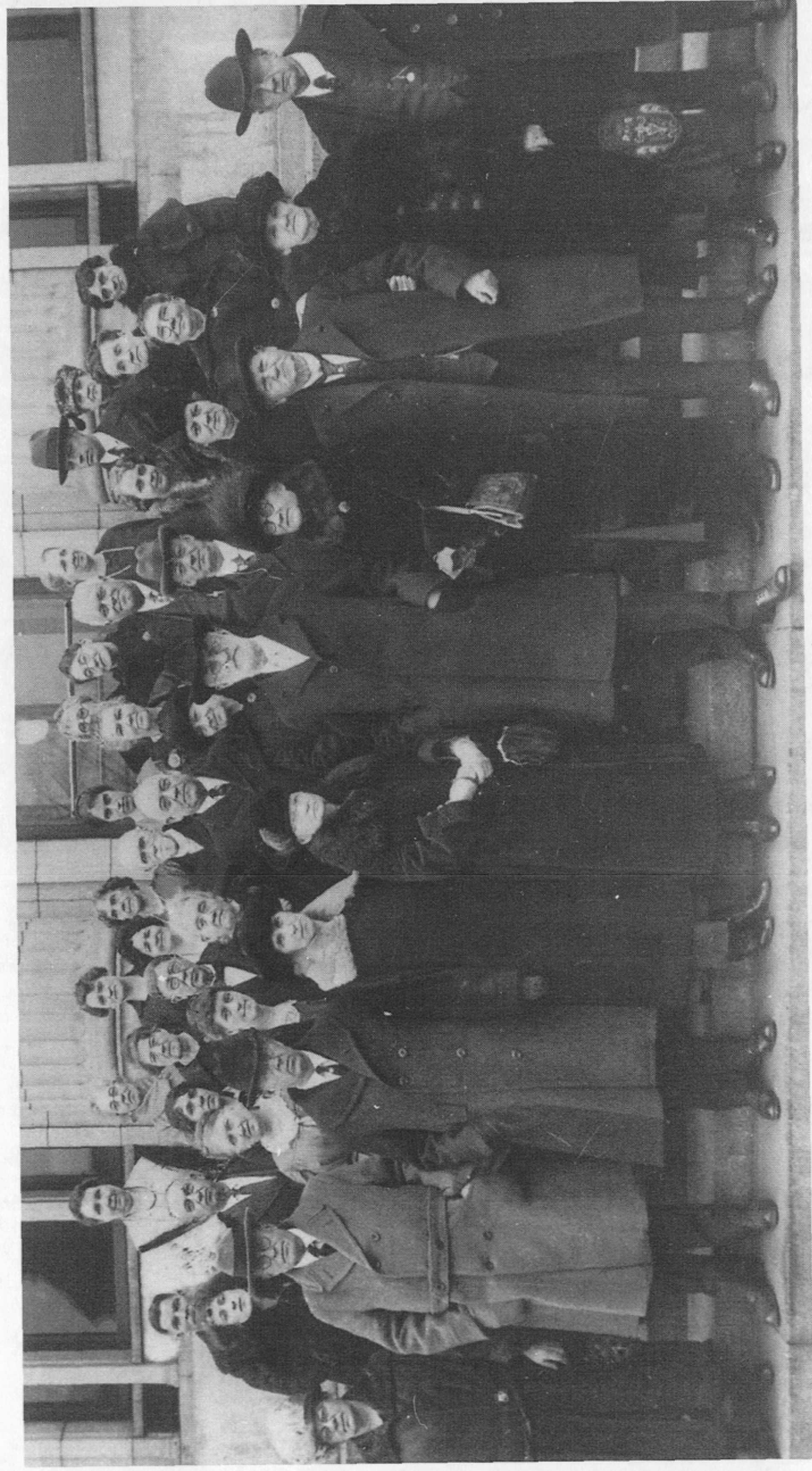
Officers and staff of the Society, 1923, in front of the Church Administration Building.