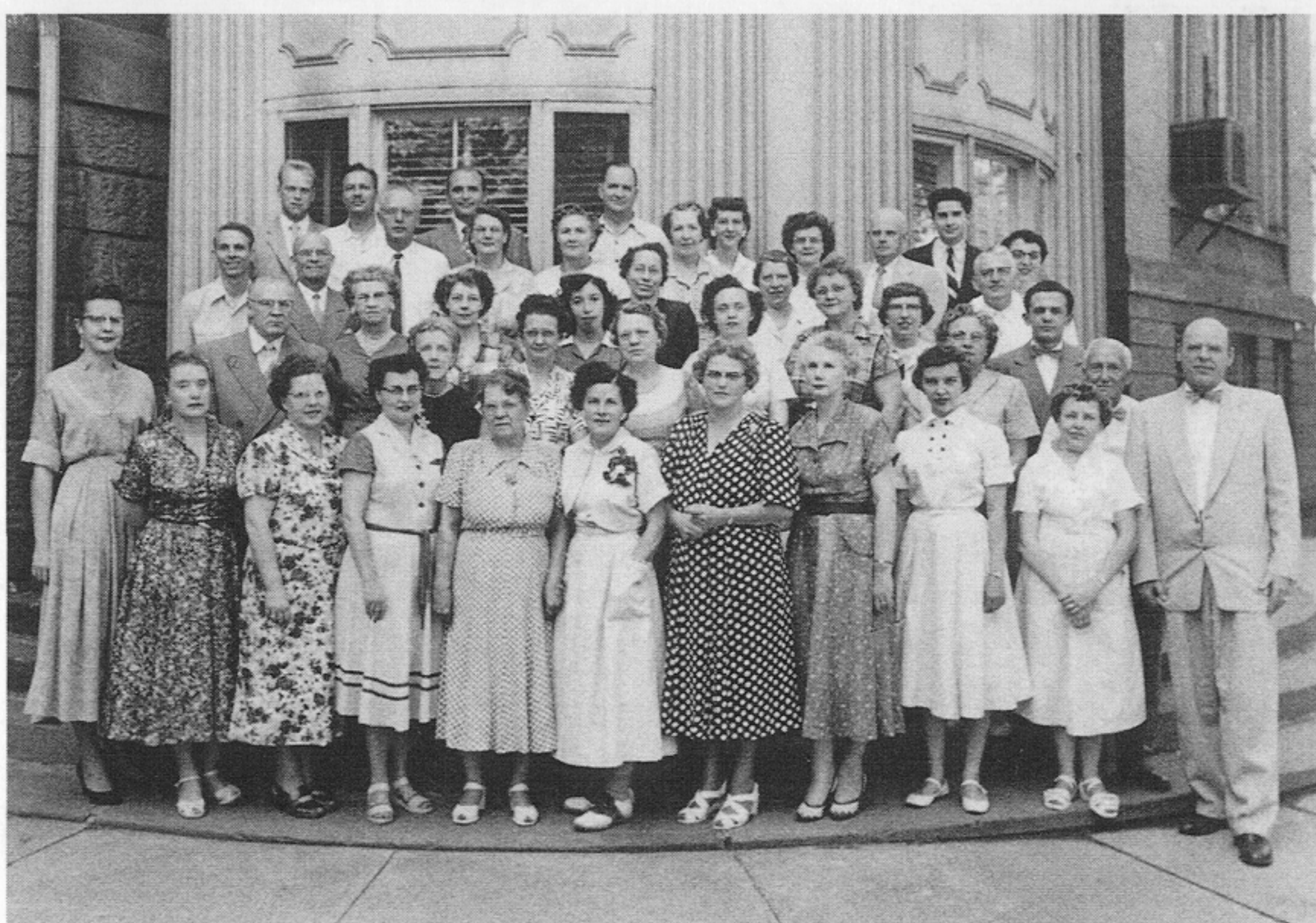
Society staff, 1954.