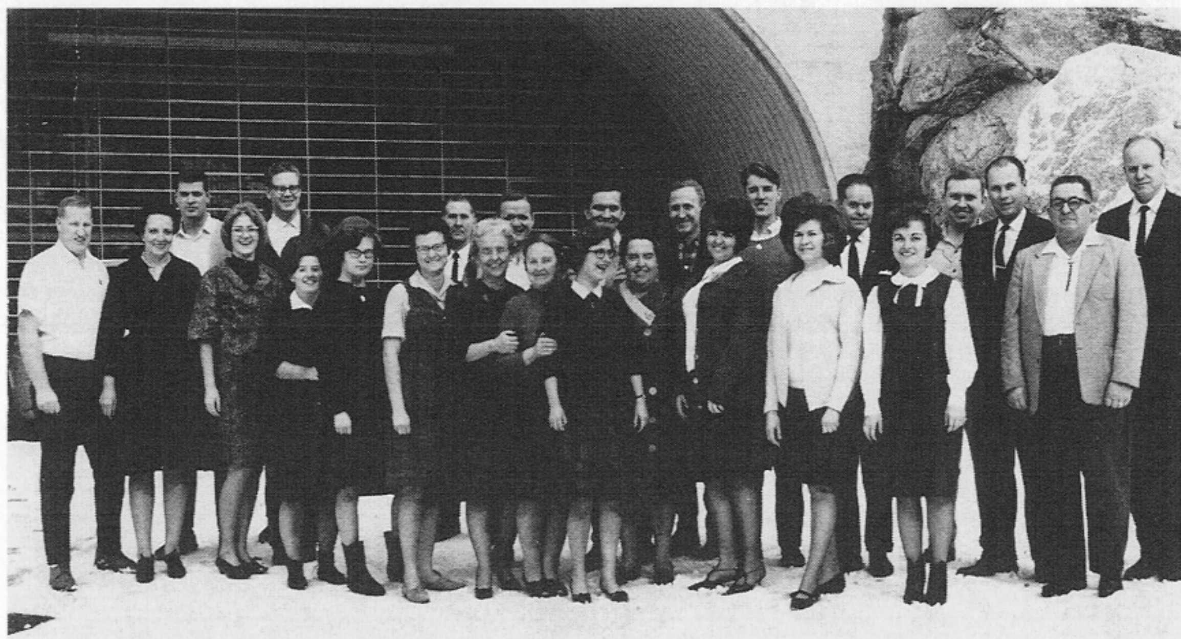
Granite Mountain Records Vault staff, 1966, in front of one of the portals.

Nature created some problems for the Granite Mountain vault in 1974, when unnaturally high amounts of moisture flowed through the rock and pooled in the cement floor below one of the vaults. The floor heaved upwards over a foot, and water began to seep into the vault. Micrographics staff donned work clothes and kept the water at bay until the problem was solved by drilling holes in the center of the floor. This measure permitted the water to flow into a floor drain and out of the vault. 75 In 1982 the water pressure built up again. Additional holes were drilled, and a permanent drain ditch installed to relieve the pressure. 76 By the flood