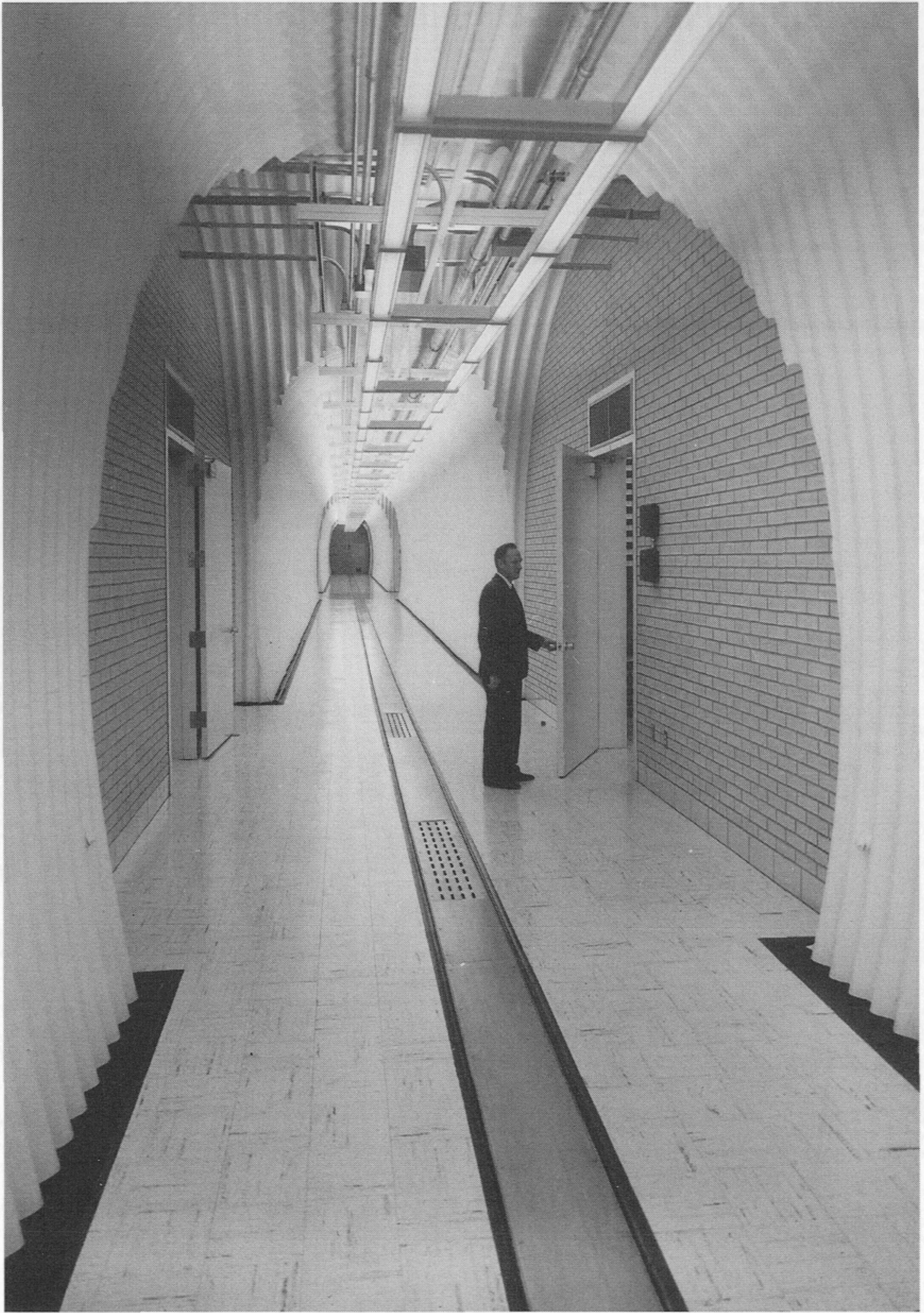
Central corridor and entrance into a record bay at the Granite Mountain Records Vault. The central corridor provides access to each of six bays where the camera masters of the microfilms are stored.