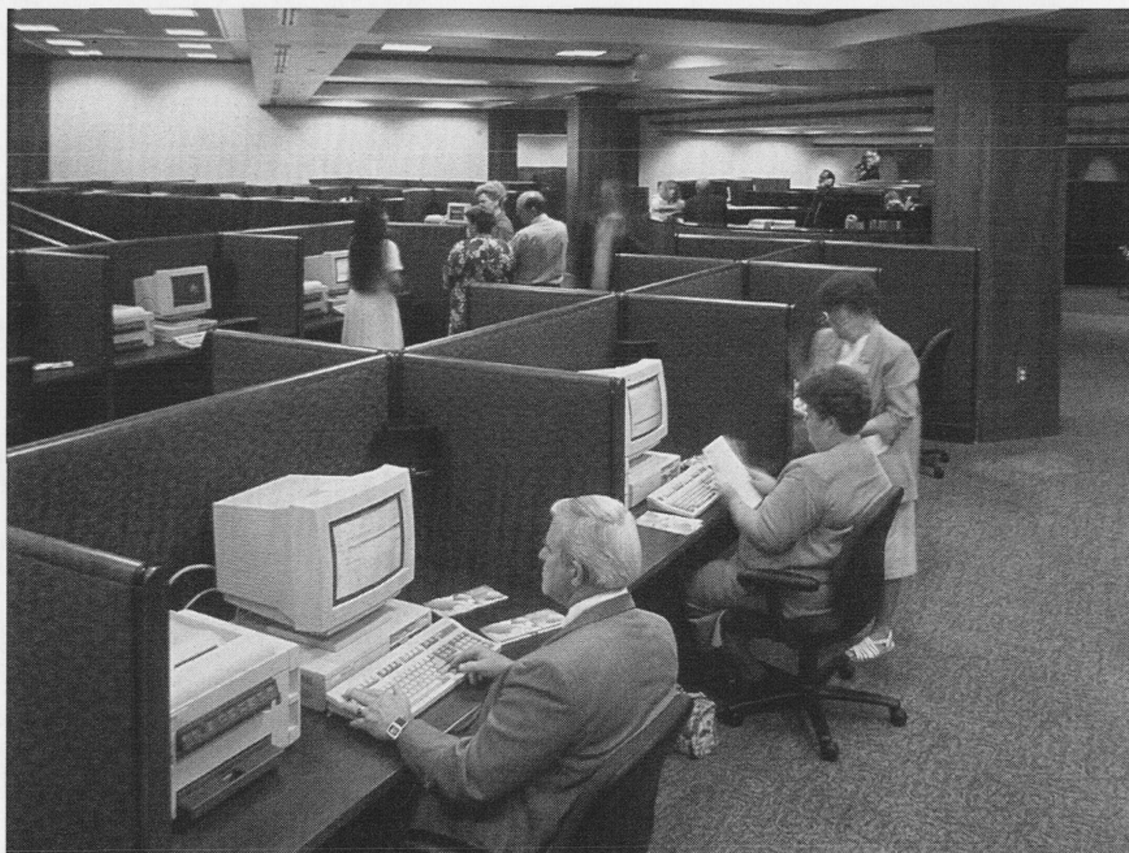
Research carrels in the Family History Library at 35 North West Temple, ca. 1986.

disc. The compact-disc catalog was first made available with Ancestral File at the Family History Library in 1988 as part of the Genealogical Information System, the prototype for FamilySearch.