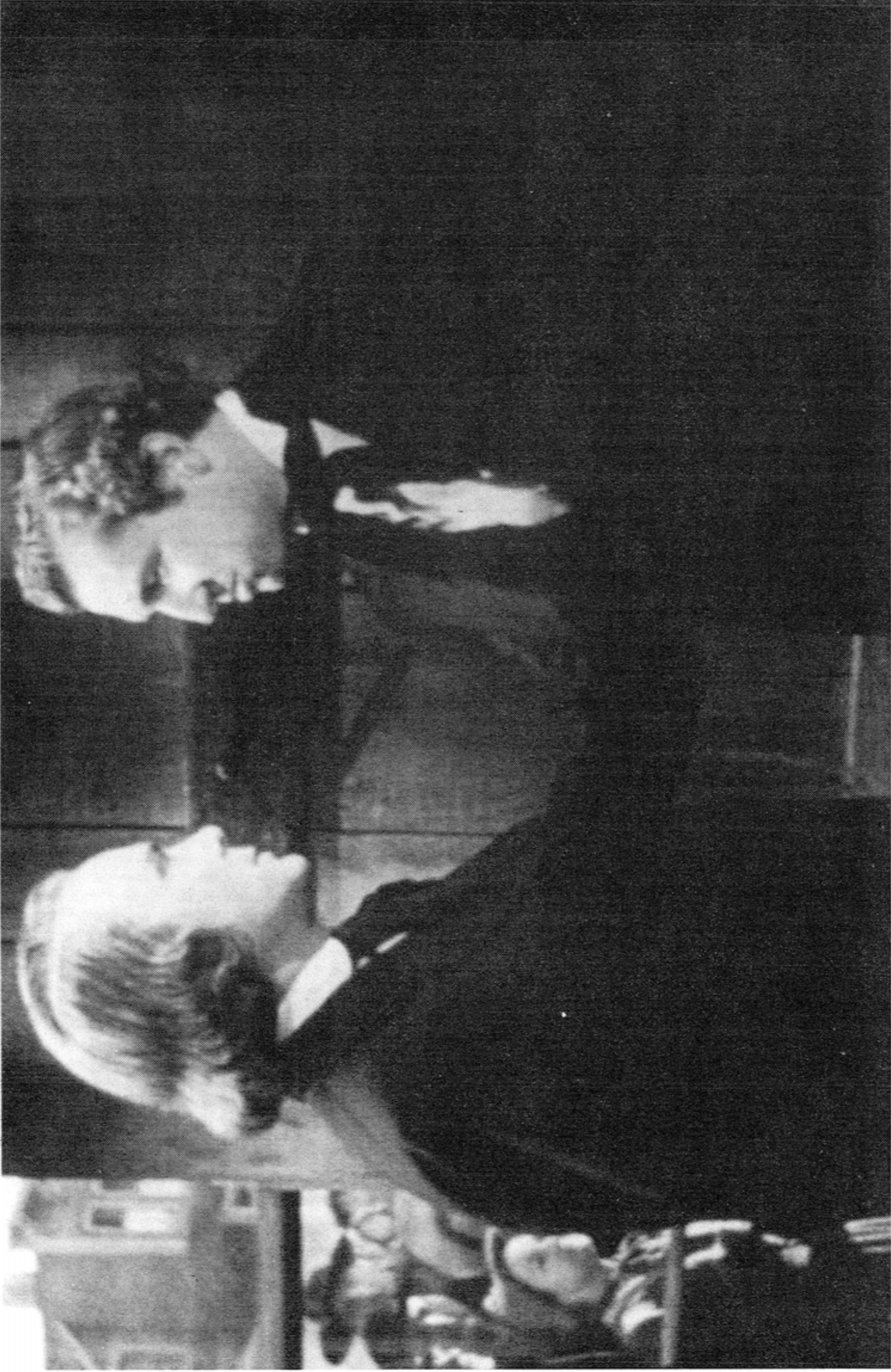
Courtroom scene, following Smith's conviction, where Smith tells Young, "I want you to take care of my people."