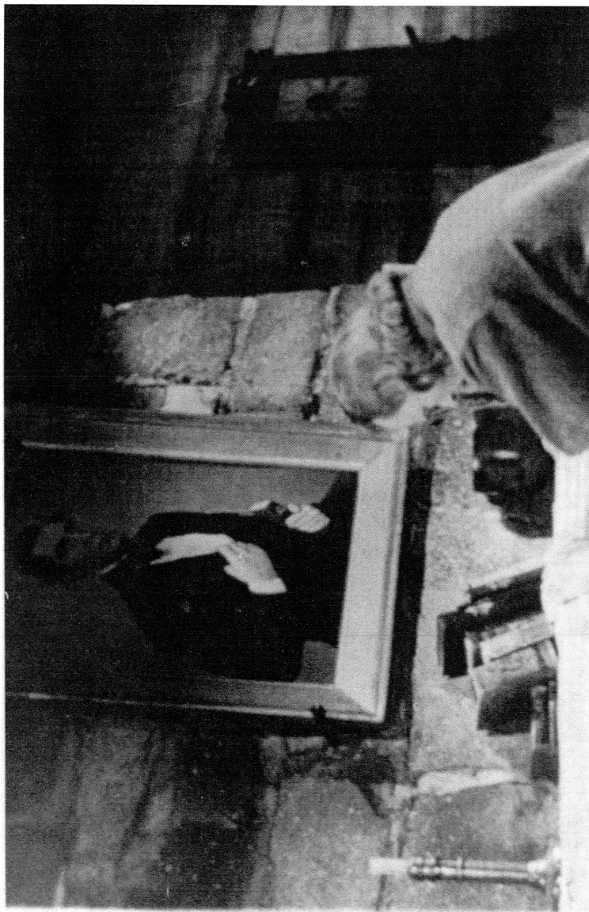
Brigham Young, in his cabin beneath portrait of Joseph Smith, near the end of the film, prays that he has not misled the pioneers into the Salt Lake Valley. Young equates in this scene the potential failure of Joseph Smith's vision of the Mormon's future and his own hopes for the pioneers.