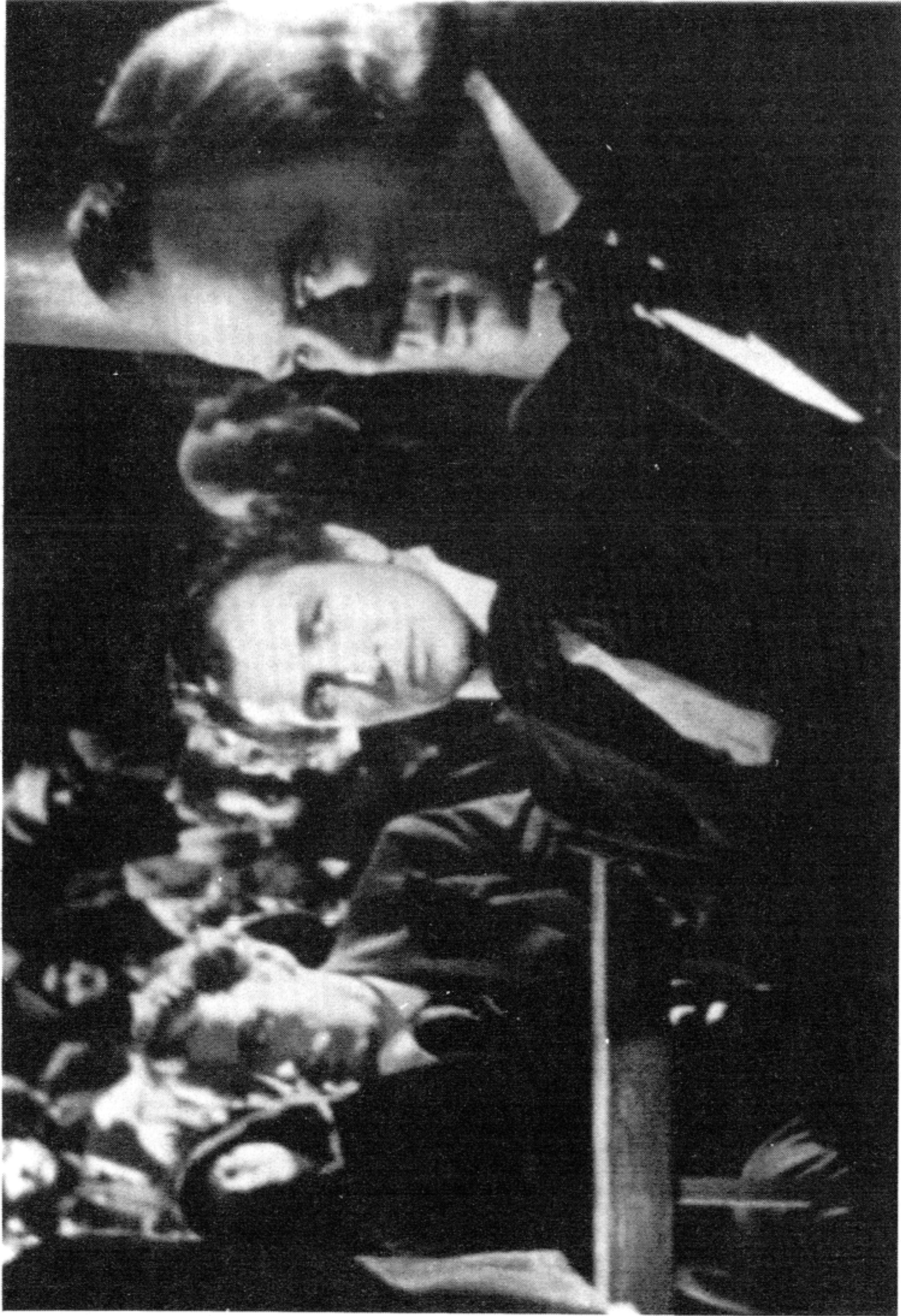
Courtroom scene showing major antagonist character Angus Duncan (Brian Donlevy), Joseph Smith (Vincent Price), and Brigham Young (Dean Jagger) following Young's eloquent appeal for Smith's life.