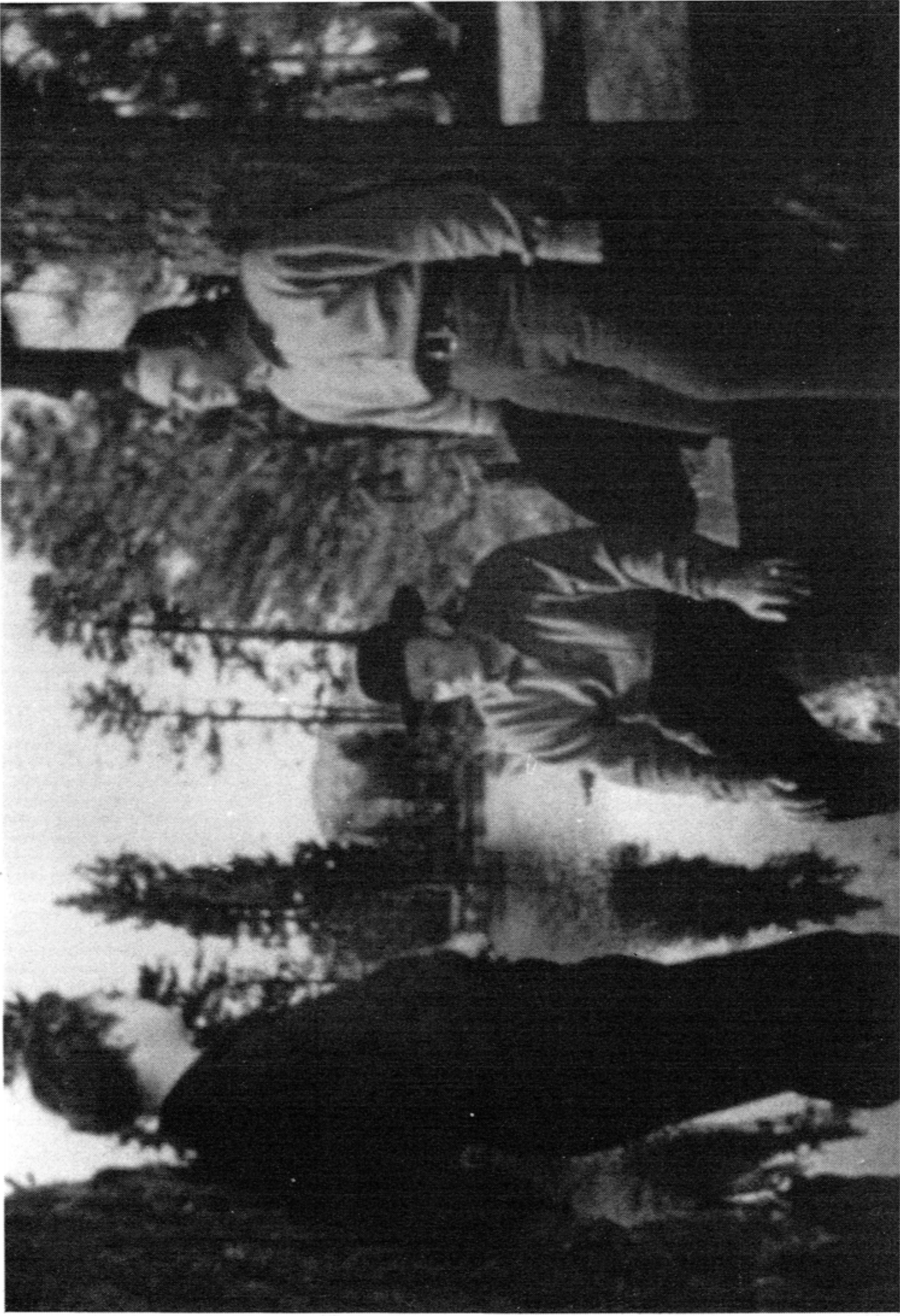
Flashback during Brigham Young's courtroom defense of Joseph Smith where he recounts meeting Smith for the first time. Note that both are standing eye-to-eye, visually foreshadowing Young's similar role as successor to Joseph Smith.