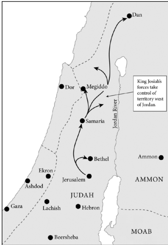
FIGURE 1. Josiah's expansion of Judah northward into former Assyrian provinces of Samaria and Megiddo, c. 625 BC. Map by the author.

kingdom of Israel until the Assyrians had conquered it and deported away its Israelite population between 732 and 721 BC. Josiah's annexations after 628 BC extended his kingdom's borders to the ancient boundaries controlled by Solomon—from Dan to Beersheba (1 Kgs. 4:25). This expanded Judah became the most prominent polity in the region for the next two decades.