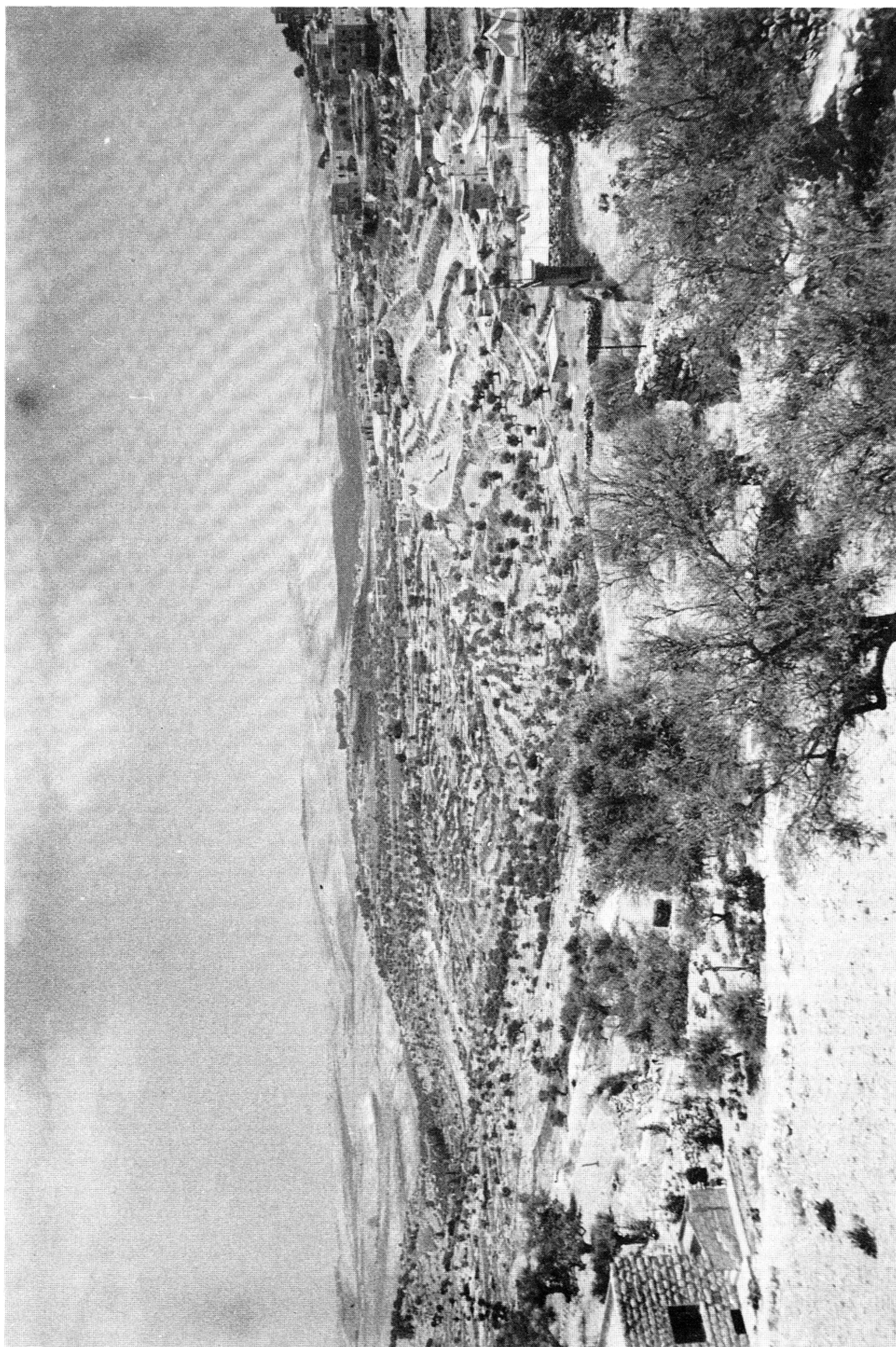
Desolate landscape area near Jerusalem.