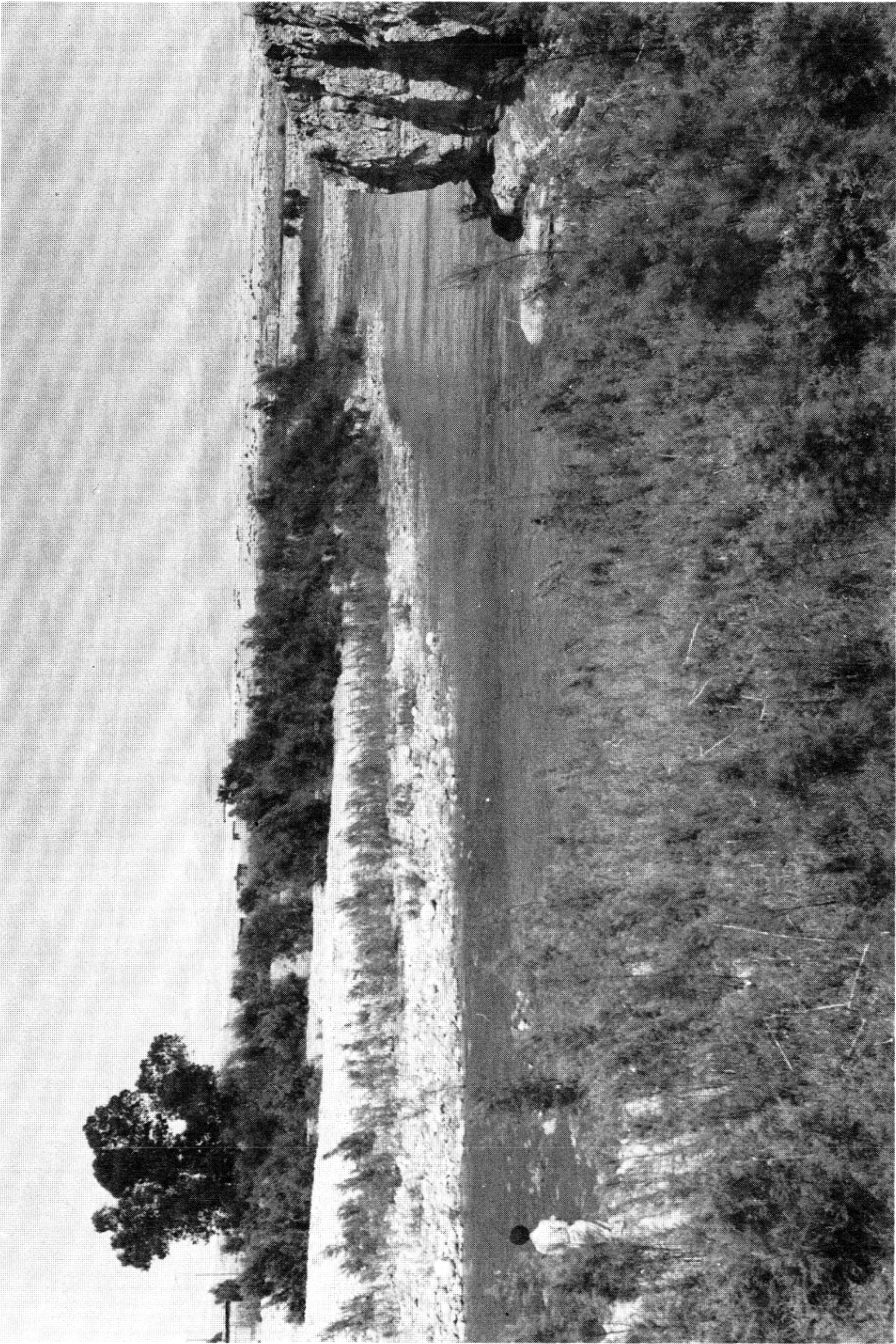
The River Jordan is no formidable boundary in this area.