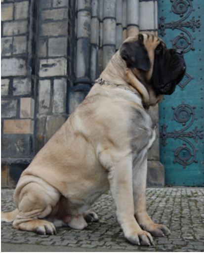
FIGURE 4. The English mastiff is one of the oldest and largest breeds of dogs.

while the Smith family was living in Far West, Caldwell County, Missouri. Young Joseph was just six years old at the time, but he remembered that Major had been in some sort of fight with another dog, and during the struggle the other dog had chewed on Major's ears, causing them to be sore. It was during this time that Joseph III's younger brother Frederick, who was two years old at the time, was placed on the floor near Major. And while mastiffs are generally known to be good-natured toward young children, on this occasion, "the baby pulled his ears, which hurt him so that he growled fiercely." This caused the Prophet to spring into action in defense of the young-