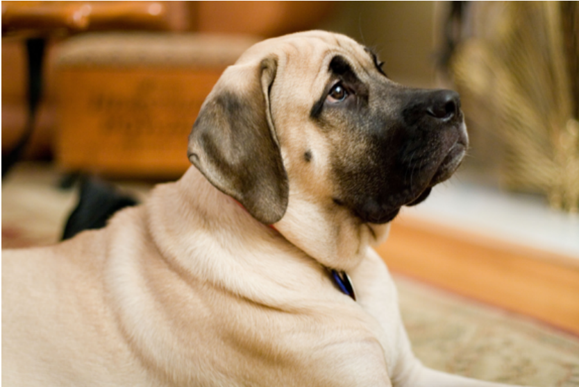
FIGURE 2. Mastiffs are known for their loyalty.

Smith, wrote that the dog was a “great mastiff,” 5 in all likelihood an English mastiff—the largest breed of dogs in terms of mass, not necessarily height or length. English mastiffs reach full physical maturity around eighteen months. Males can weigh anywhere from 160 to 230 pounds, females from 120 to 170 pounds. They have large, square heads, a black mask (face), black ears, and drooping jowls (with plenty of excess drool and slobber). Because of their size, they have a relatively short life span, generally from eight to ten years, but some live longer. They are powerful and muscular canines (figs. 2, 4). In spite of their size, English mastiffs are the gentle giants of the dog species—affectionate,