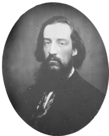
FIGURE 3. Joseph Smith III. After the martyrdom, Old Major became the loyal companion of eleven-year-old Joseph Smith III.

Joseph Smith III (fig. 3) had two early recollections of Major, both of which took place in the fall of 1838