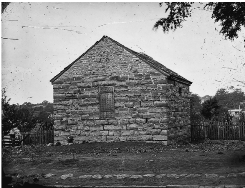
FIGURE 6. Liberty Jail, c. 1878, This is the earliest known photograph of the jail.

If Joseph Smith was allowed to have his dog with him during his Missouri imprisonment, it is not known exactly when Major was actually with him, but there are some clues. On October 31, 1838, the Prophet and six other Mormon leaders were arrested at Far West by Samuel D. Lucas, major general of the militia companies from Jackson and Lafayette Counties. During the month of November, the Mormon prisoners were temporarily incarcerated in Independence (November 4–8), and at Richmond (November 9–29). Following a seventeen-day court of inquiry in Richmond, Joseph Smith, Hyrum Smith, Sidney Rigdon, Lyman Wight, Alexander McRae, and Caleb Baldwin were charged with treason and ordered to be sent to Liberty Jail in Clay County to await the spring term of the circuit court. While it is possible that Major may have been with Joseph Smith during his short stay in Independence and his nearly