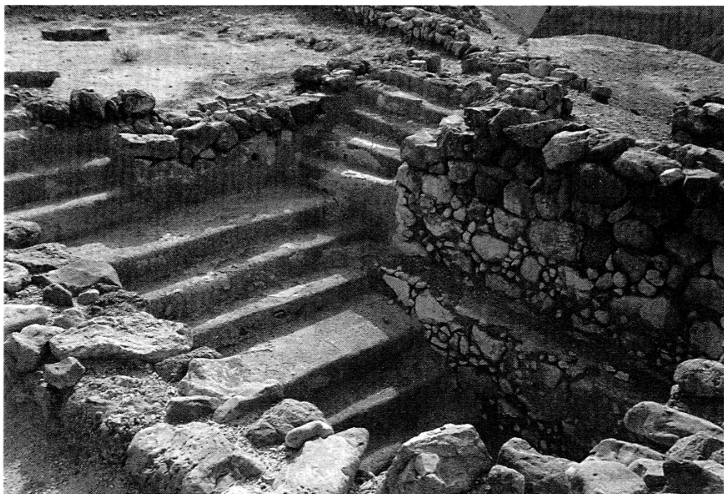
Miqveh at Qumran

Bryant Wood, of the University of Toronto, in his study of the water installations at Qumran, gives reasons for arguing that they are miqvaot: (1) In the view of Wood, who estimated the average population at Qumran and calculated their daily water requirements and the available water supply, the residents of Qumran had twice as much water as they needed to maintain themselves; the excess water was used for ritual baths. 17 (2) Wood observes that there are two types of water installations: those with stairs running the length of the water installations, and those without. Those with stairs Wood identifies as miqvaot, since “this design required more care in shaping and was, in fact, a very inefficient design for a water storage tank . . . necessitating an increase in the other dimensions to obtain the required volume.” 18 Those installations without steps Wood views as cisterns for culinary and drinking water. (3) Wood believes that the water installations were too elegant to