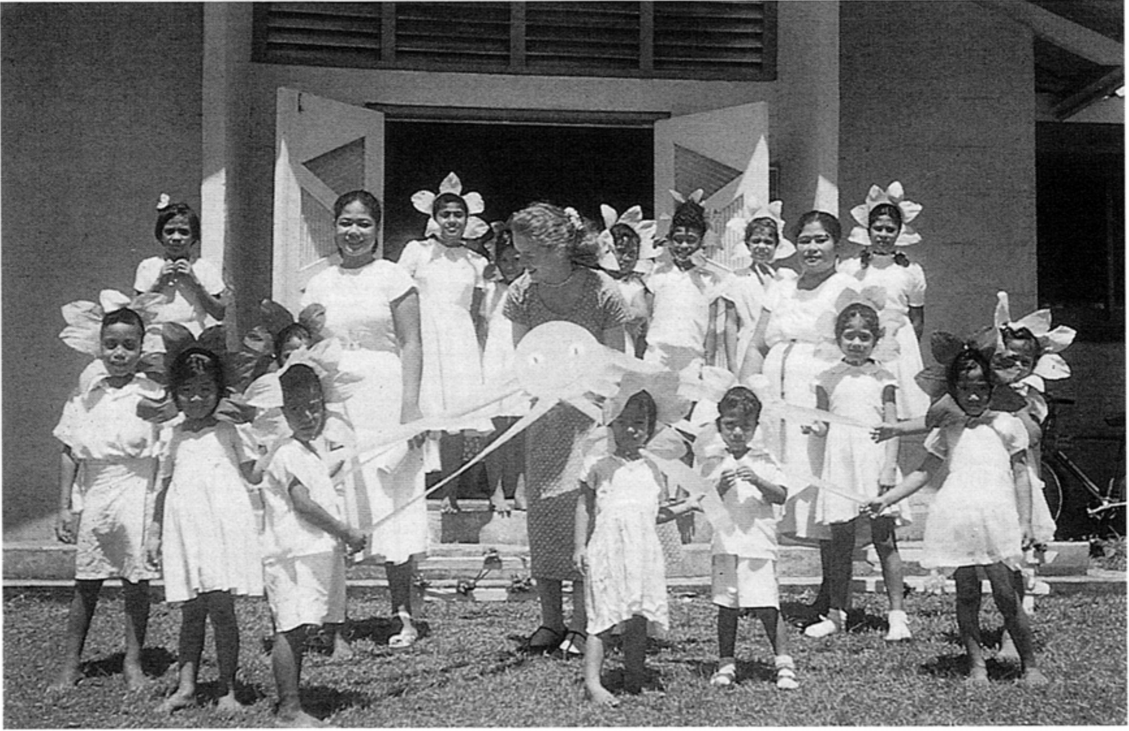
Primary children from the Vailu'utai Branch on the island of Upolu, Western Samoa, posing on the chapel-school steps just after they presented a sacrament meeting on the theme, "Who is greatest in the kingdom of heaven?" They are dressed as flowers, with petals framing their faces, and each is holding a ray from the sun at the center, representing the light of Christ that helps them grow. March 1955.

discussed cultural relativism in general and specifically the ethics of intruding on other cultures with our American values and customs or particular religious doctrines and prescriptions. When we got our call and read Margaret Mead, we wondered together how we might avoid the various forms of "imperialism" and were determined to be very careful. And we did find, in Samoa, there were severe temptations toward racism and classism, as well as garden variety cultural snobbery. We matter-of-factly allowed ourselves, ignorant twenty-year-olds, to be addressed in the higher form of Samoan traditionally reserved for chiefs and distinguished elders, to be given the chief seats at feasts and served delicacies—and to be carried through the surf to a canoe. We were part of conversations that discussed the "curse" that was on these native peoples, whom we believed (and found confirmation in the origin myths they shared with us about ancestors coming from the east and living only on the cool and high peaks like those they came from) were descended from the Book of Mormon peoples of America—and even found ourselves occasionally stereotyping the Samoans as unambitious or childlike or easily angered. We were much sobered when people we tried to encourage in difficult new tasks and skills