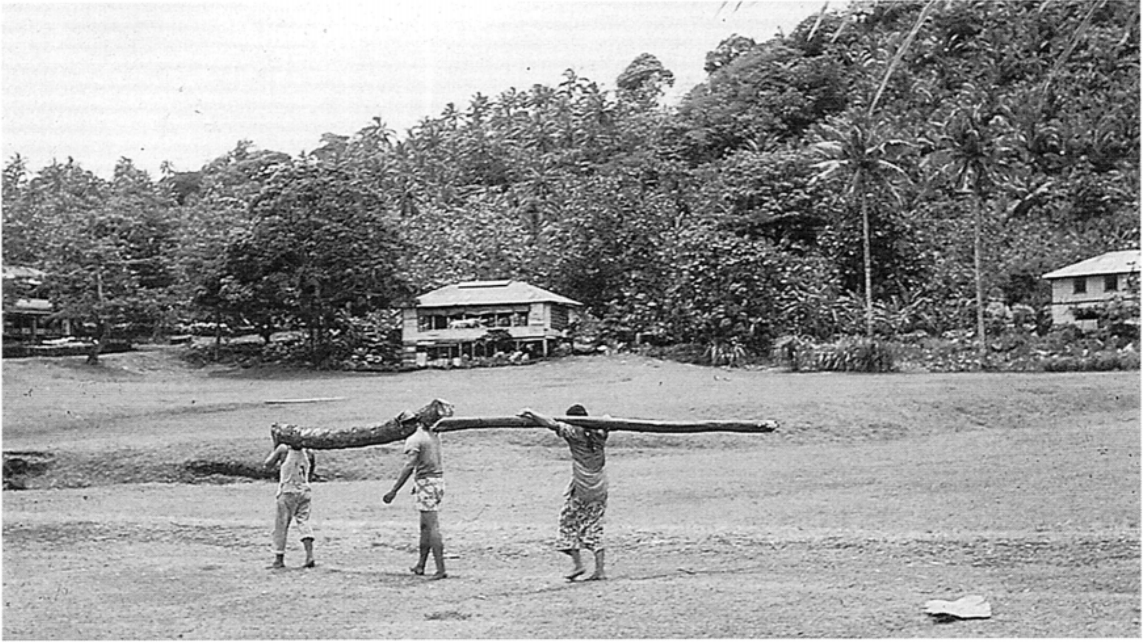
The village green ( malae ) in Vaiola, circled by fales , with a cricket pitch just behind the children, who are carrying firewood from the jungle. September 1954.