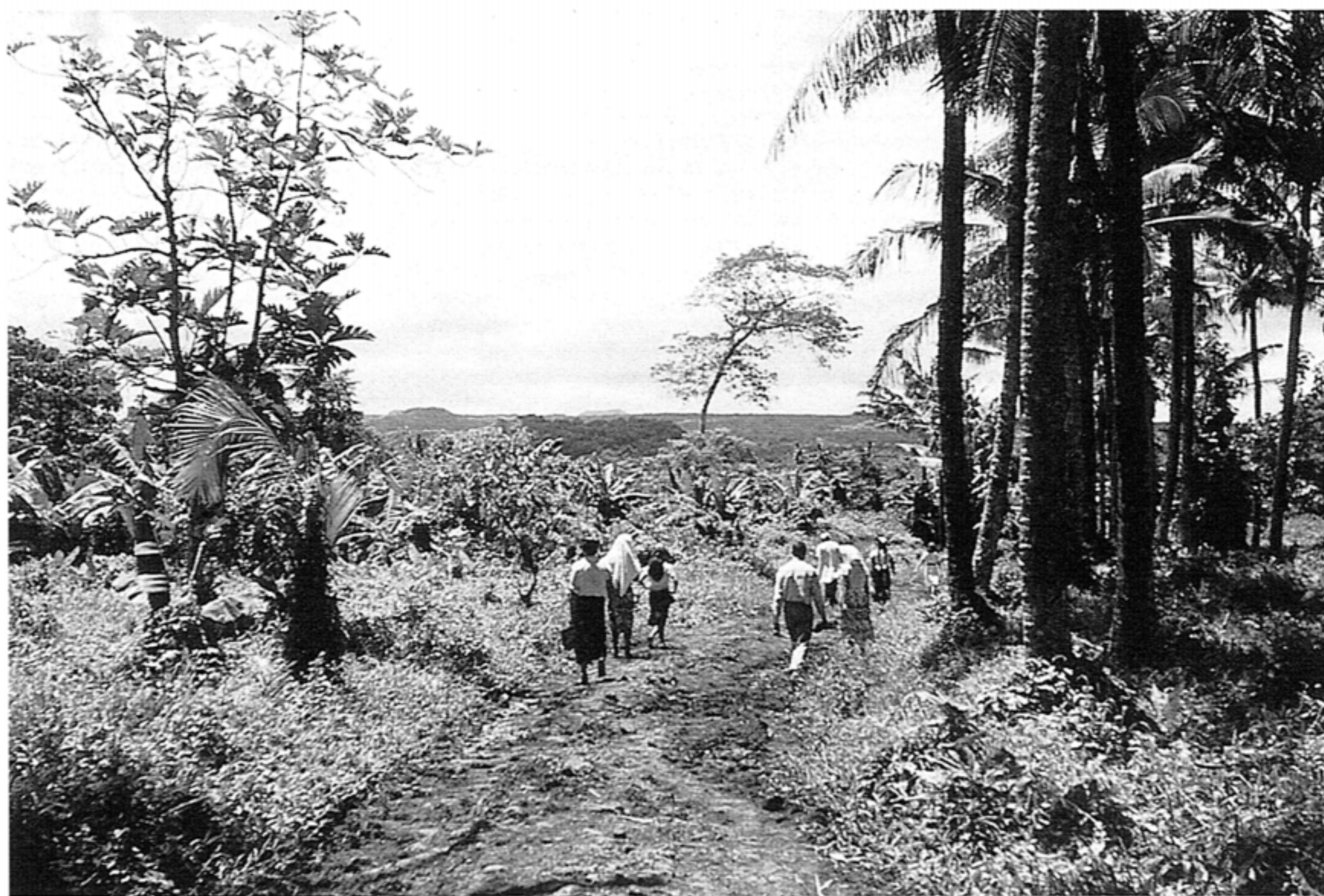
Elder Hanks, our supervising elder, and school children, walking ahead of us up the "road" to Vaiola. August 1954.

By now it was dusk, the sun down but still lighting the clouds with orange and purple. After Elder Hanks helped Si'usi'u wade out into the