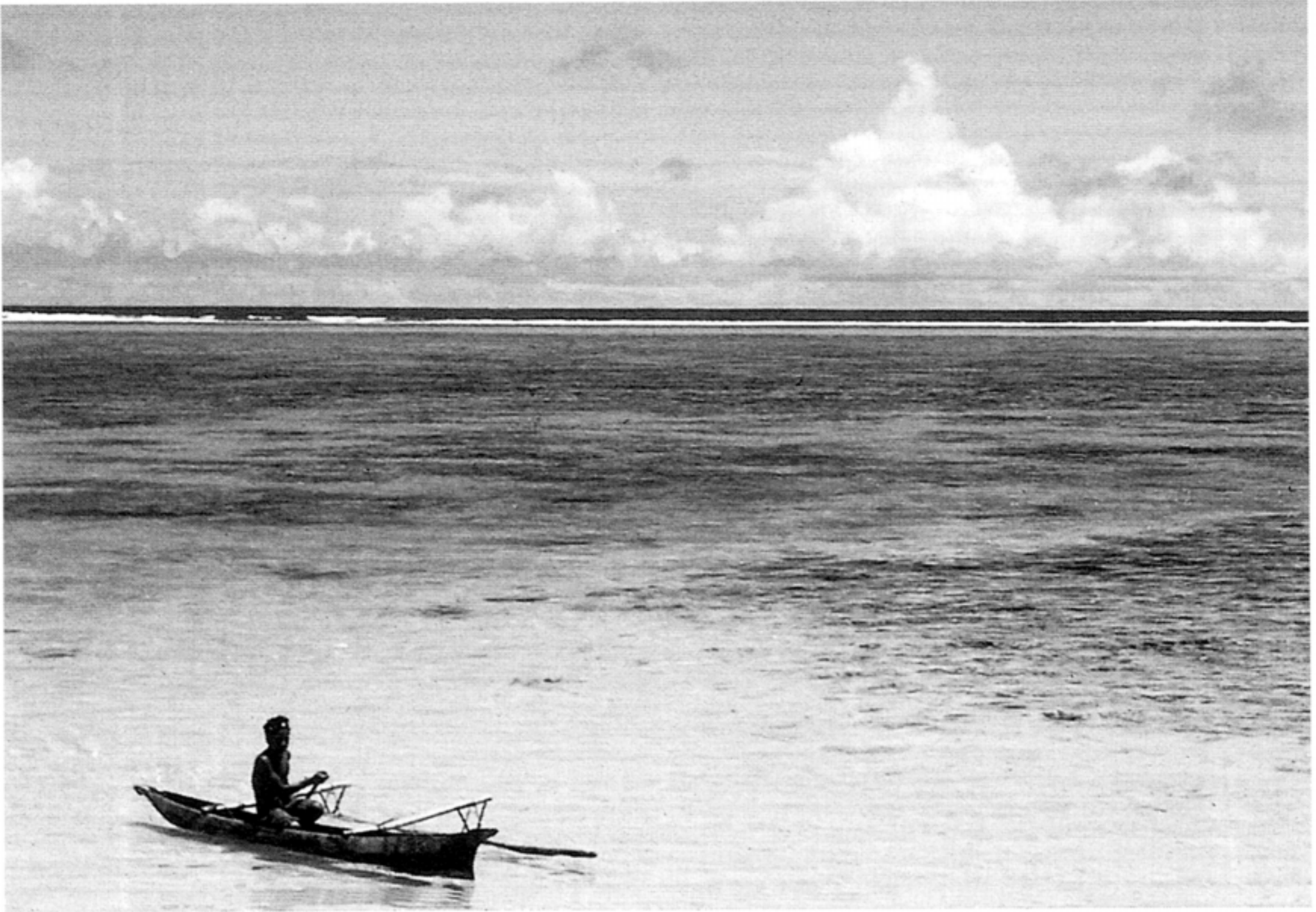
The reef off Savaii, with a Samoan Latter-day Saint bringing in his day's catch in an outrigger canoe ( paopao ) made from a hollowed-out log.

Protestant Bible that had been given to the branch president's grandfather by one of the first Mormon missionaries.