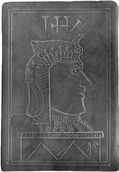
FIG. 9. Slate tablet, 8\frac{3}{16} " by 5\frac{5}{8} ". This artifact was unearthed near Detroit on May 14, 1908. From Rudolph Etzenhouser, Engravings of Prehistoric Specimens , 20.

opened two mounds and unearthed three objects: the copper head of a battle-ax, a small perforated slate tablet or pendant, and a knife blade. They planned to meet for further excavations the next day but were rained out. Inclement weather precluded digging the following day as well, so Talmage visited both Soper and Savage to examine their collections further. Finally, on the fourth day, they resumed their work under clear skies. Talmage, Soper, and Scotford returned to the area of their previous venture and opened a dozen mounds over the course of the day. Again, they struck it rich. With his own hands, Talmage removed from the excavations two slate tablets and another knife blade. 53 One slate exhibited the Flood story on one side and on the other a battle between Indians and a "civilized" group. 54