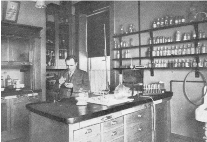
FIG. 10. James E. Talmage at work in the laboratory of the Deseret Museum in Salt Lake City, ca. 1911. Talmage's meticulous analysis led him to conclude that the Michigan Relics were frauds. From James E. Talmage, "The Deseret Museum," Deseret Museum Bulletin , new ser., no. 1 (August 1911): 29.

cold-blooded, barefaced, contemptible deception that the writer ever ran up against." 62 Soper threatened to sue Talmage and have him arrested. 63