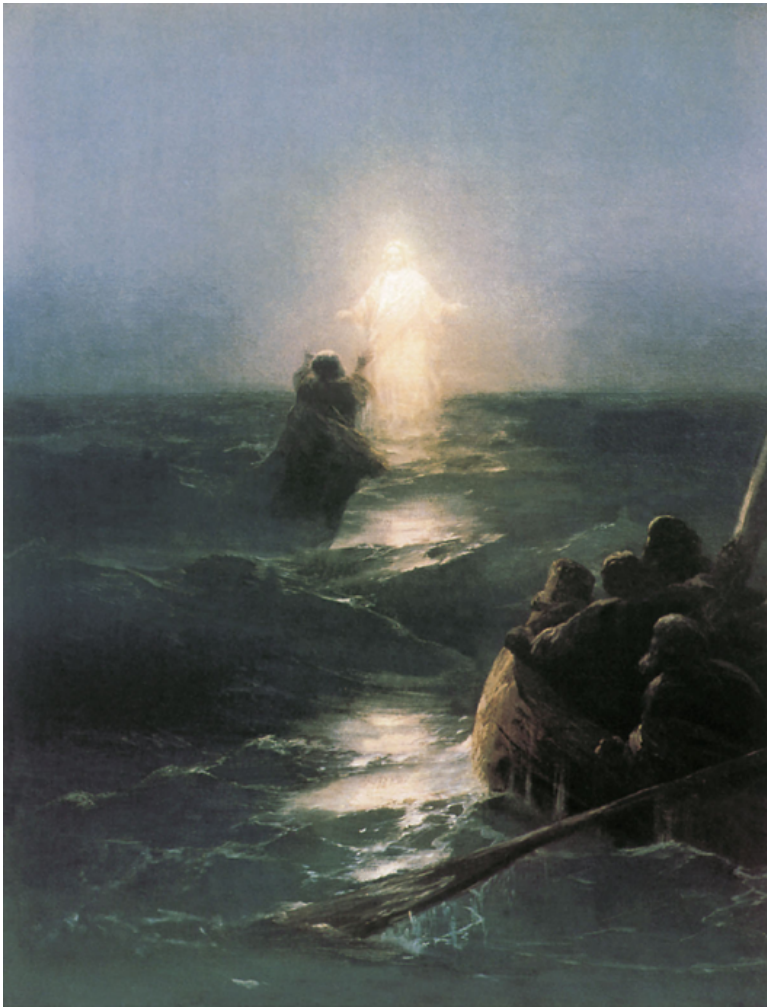
The scriptures are filled with images of light, the most memorable being Christ's simple declaration, "I am the light of the world." Ivan Aivazovsky, Jesus Walks on Water , 1888 (public domain).