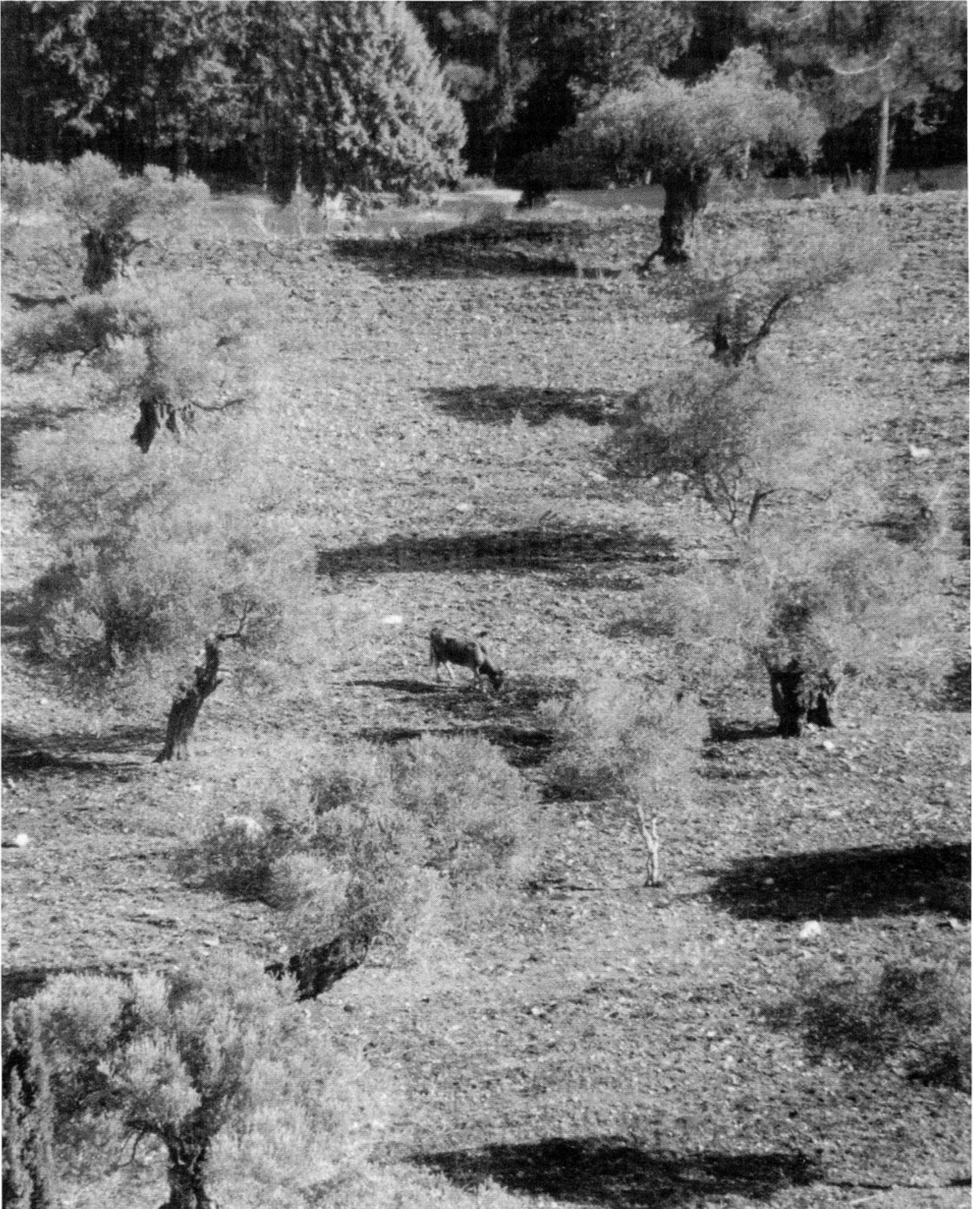
FIG. 3. These olive trees stand on a hillside in the eastern Mediterranean region, a major olive-producing area for centuries. These trees have been planted with room for growth and cultivation. Olives flourish in rocky areas with ample light and adequate moisture. Regular pruning is required, and good orchards are kept free from weeds and trimmings.