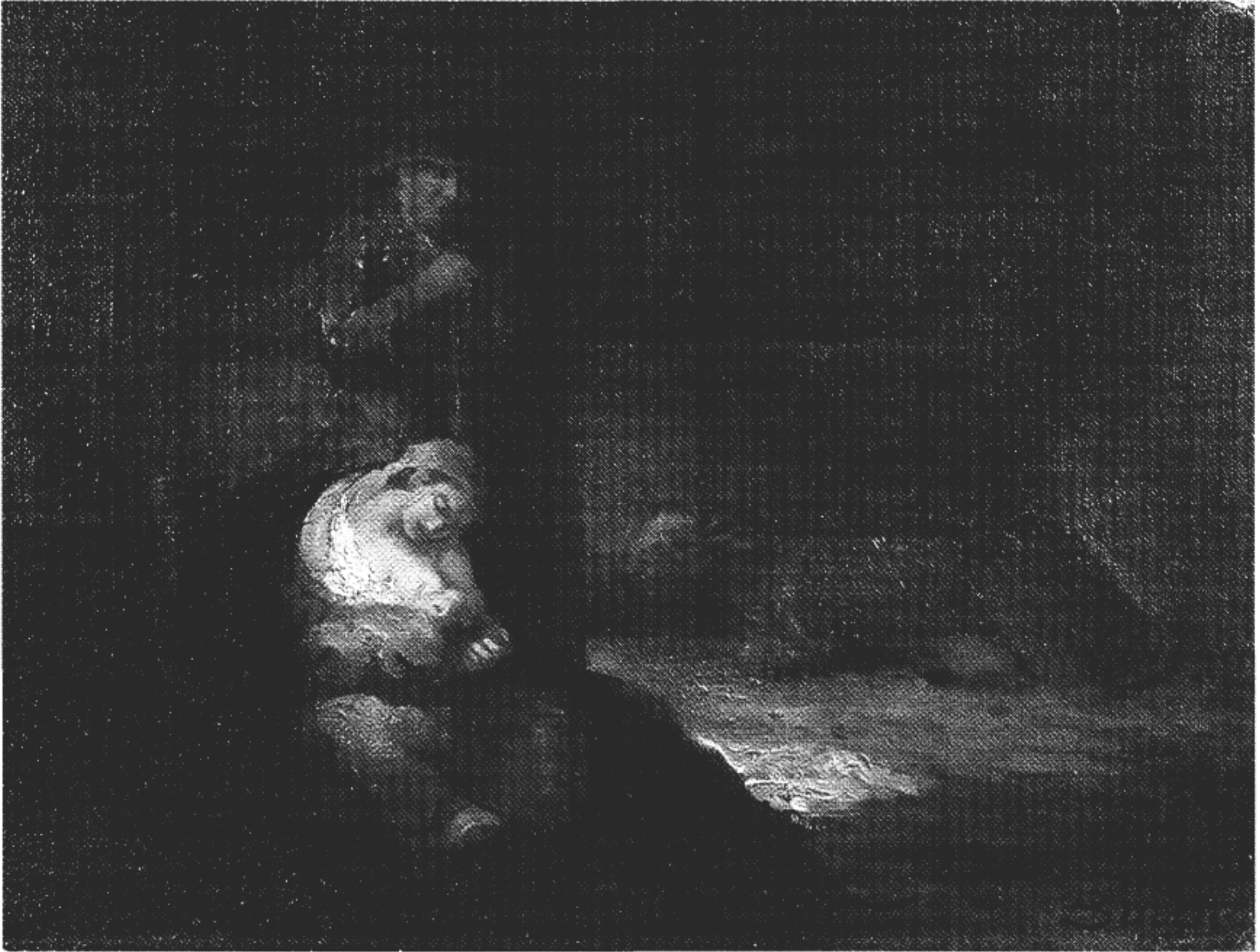
Richard Burde, The Nativity . Oil on canvas, 10" x 14", 1968. Photograph is cropped.

Mary and Joseph are painted as a German peasant couple in a German barn. Burde is following a tradition in German art of localizing a scriptural story to help people personally relate to it.