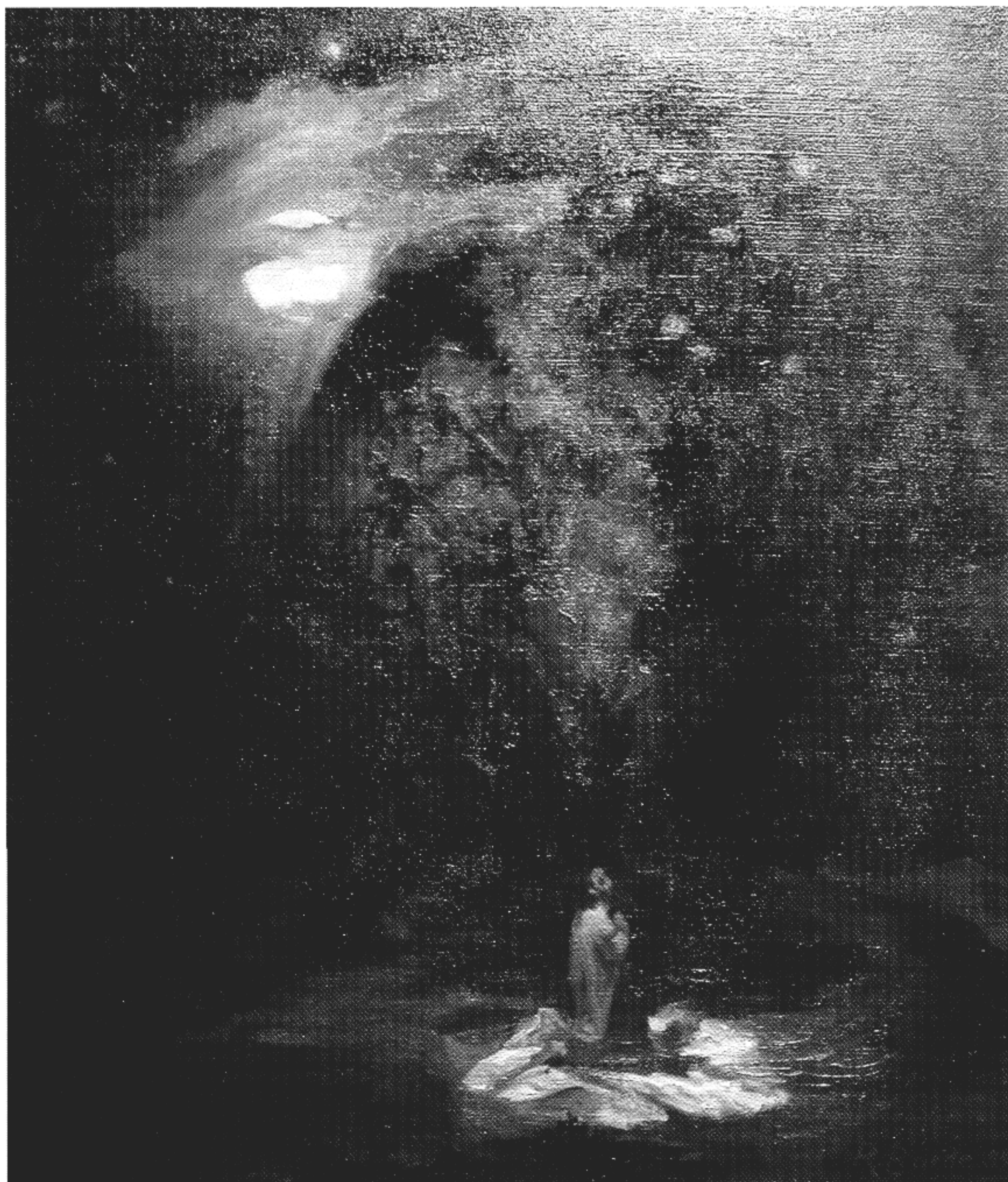
Richard Burde, Christ in Gethsemane . Oil on canvas, 10" x 15", 1959. Location unknown.

The only one who could atone for human sins, Jesus Christ is shown isolated, with the universe weighing upon him. The photograph reproduced here is apparently the only surviving image of Burde's conception of the Lord's agony in Gethsemane.