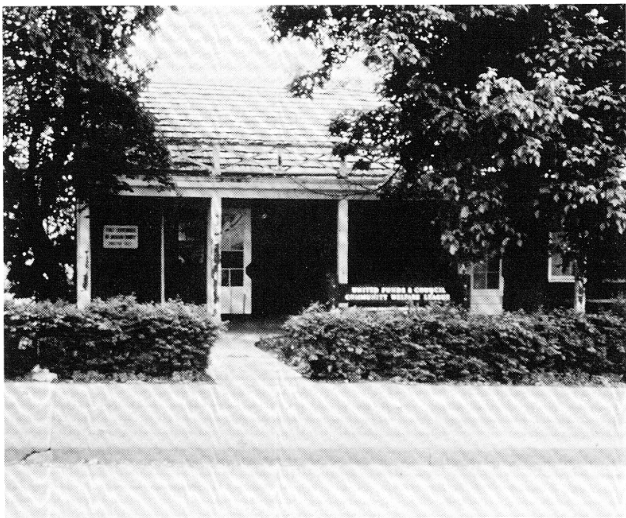
The first Jackson County Courthouse as it appears today.

built only as a temporary frontier facility, has been preserved by an historical society [see illustration #1], and that a third courthouse—the second permanent brick structure—was immortalized in about 1850 by an unknown artist's etching [see illustration #3]. This rendition has been widely reprinted and sometimes mistakenly designated as the first permanent brick courthouse. 2