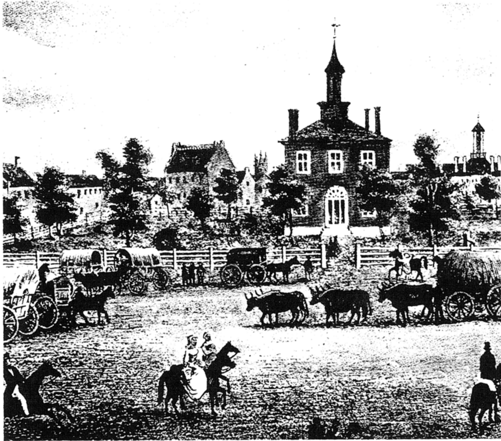
The second brick courthouse on the square in Independence, Missouri, as pictured by an unknown artist, c1850.