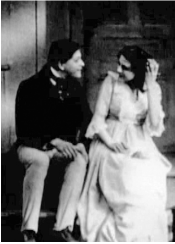
Young Joseph Smith courting Emma Hale in a scene from One Hundred Years of Mormonism (1913).

by a live lecturer. Feedback resulted in some cuts and reshoots, including footage from the April 1913 general conference that was shot and added to the film with First Presidency approval. 42 The film went into a limited general release in June, by which point it had grossed $25,000. The extent of its distribution is not clear, but trade journals report a states' rights approach in the domestic market with London alone as the only probable foreign venue. 43