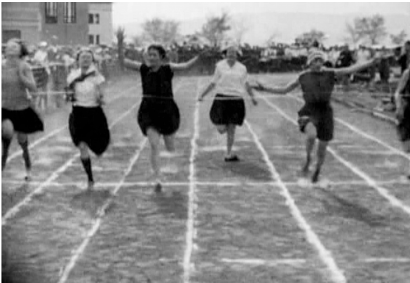
The Clawson brothers filmed events at the 17 th Annual Track & Field Meet and Relay Carnival at BYU on April 29 and 30, 1927. The intertitle for this event reads, "Dashing Girls (50 Yards)."

Over the next decade, the Clawsons worked intensely, eventually moving to the basement of the Deseret News Building on South Temple and Main Street. They supplemented their religious work with advertisements, titles, and newsreels, but Church films remained their passion. They shot invaluable records of dozens of General Authorities on the streets, temple grounds, and in their offices and homes. They recorded Joseph F. Smith's funeral, Boy Scout excursions, monument dedications, parades, conferences, athletic events, picnics, and dozens of other activities and scenic shots, in Salt Lake and elsewhere. Virtually nothing escaped their lens; they even filmed President Grant playing golf. 50