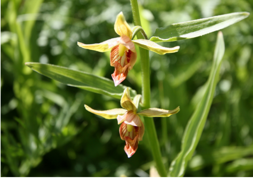
FIGURE 4. The orchid Epipactis gigantea . “Epipactis gigantea stream orchid close” by Dcrrjsr, https://commons.wikimedia.org/wiki/File:Epipactis_gigantea_stream_orchid_close.jpg , licensed under Creative Commons Attribution 3.0 Unported license.

I called up the Utah state meteorologists and asked what the weather was at a proposed missile site on the sample date. An hour later, I got a call back. The state meteorologists were not sure what the weather was at that exact spot, but a weather station in Milford, Utah, about sixty miles away, recorded a meter of snow on the ground on that date. As I hung up the phone, I realized that the situation with the MX EIS was far more serious than I had ever assumed. The MX vegetation data had been faked.