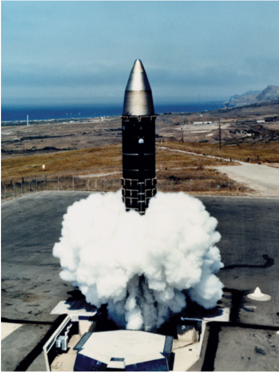
FIGURE 1 ( left ). The MX missile carried ten multiple reentry vehicles, each of which could be independently targeted.