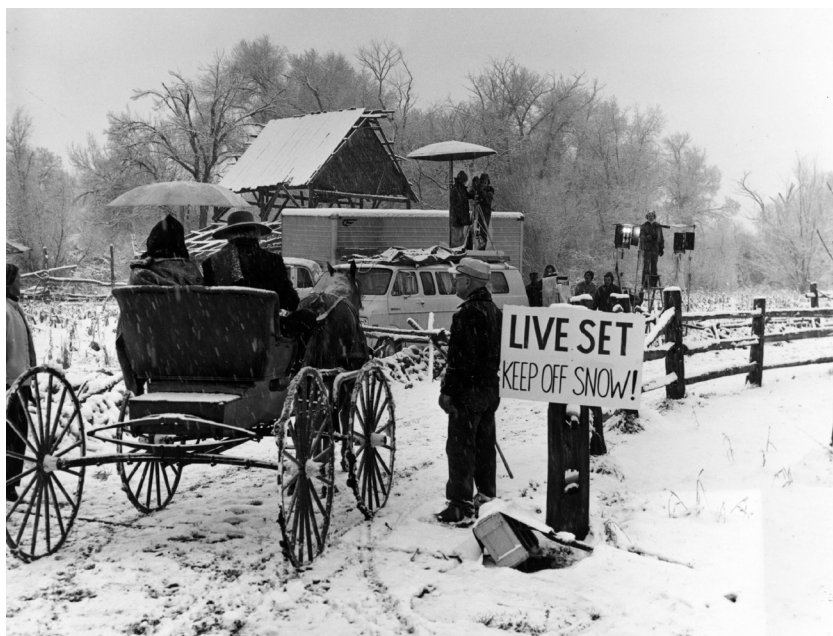
The snowy set of The Lost Manuscript (1974).