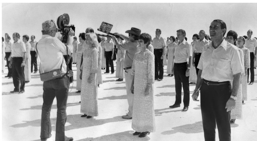
Members of the Mormon Tabernacle Choir being filmed while singing on the Salt Flats near the Great Salt Lake. Beginning in the 1960s with Choir for All the World , the Salt Lake Mormon Tabernacle Choir , the famed LDS singers would be the subject of many performance films and documentaries, including Lee Groberg's America's Choir: The Story of the Mormon Tabernacle Choir (2003).

The Church's developing interests in broadcasting (primarily through KSL-TV) broadened the reach of institutional films and led to production of film outside of the BYU studio. KSL was suffering in the early 1950s and received a major overhaul under President McKay, beginning with the installation of Arch Madsen as president. KSL's productions were primarily event-related, such as general conference and concert films made of the Tabernacle Choir, but as it grew the station delved into documentary and fiction programming. It even released material on film, such as a