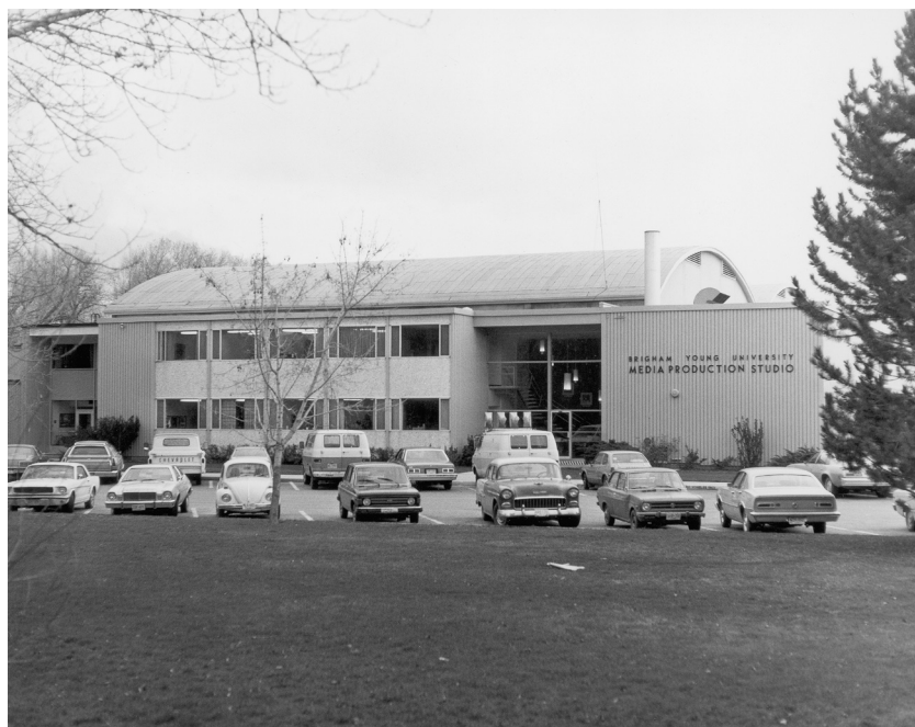
The exterior of the BYU Motion Picture Studio soon after its 1958 construction. Though the studio has been enlarged and remodeled, the façade remains recognizably similar today.