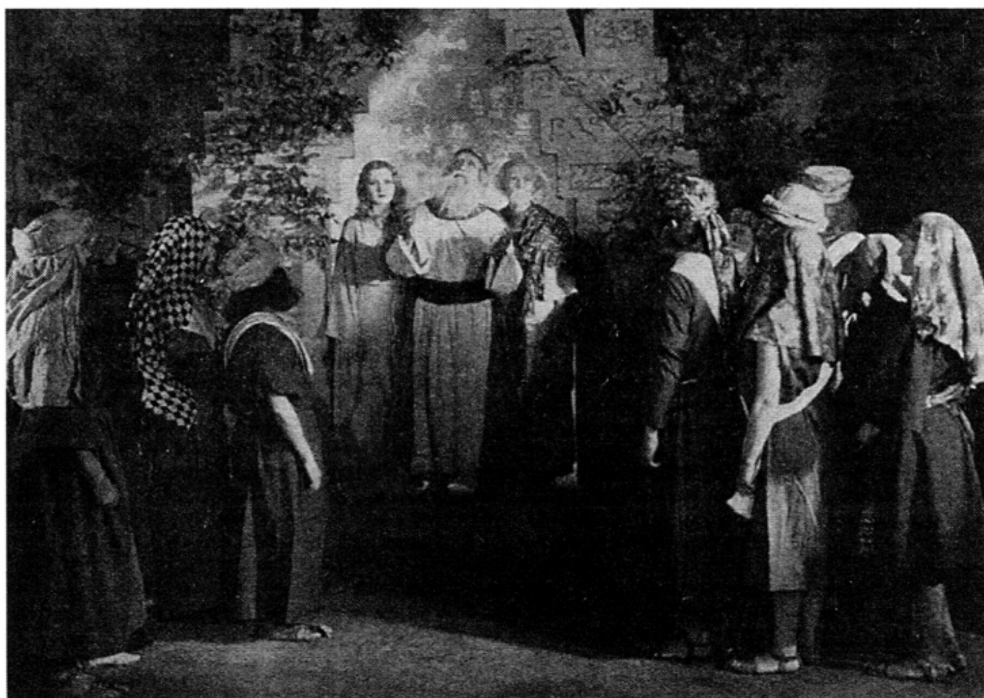
Welcome to Zarahemla.