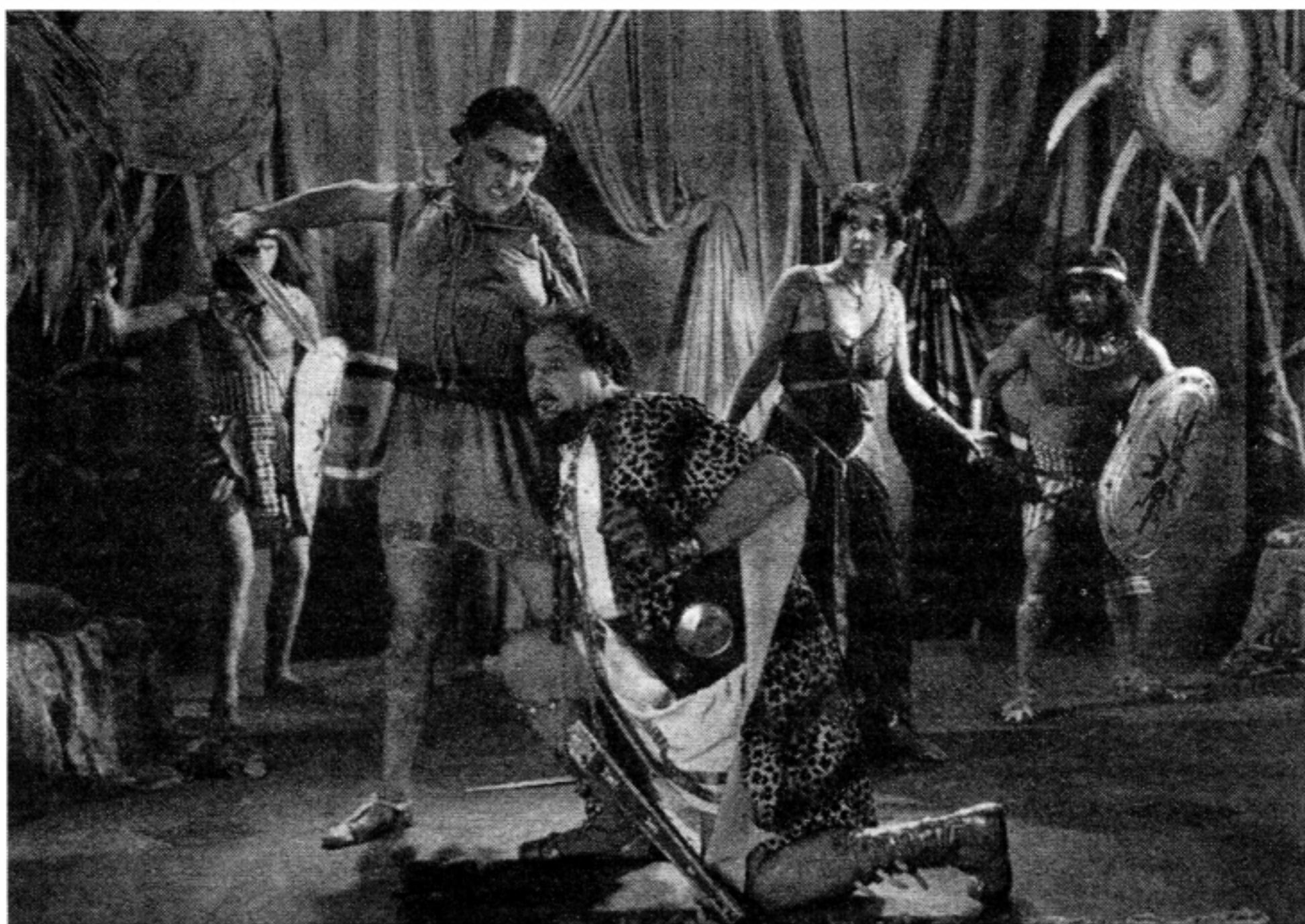
"Shiblon, thou art avenged."